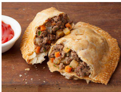
Beef pasty

First, we'll enjoy a dinner of pasties —that delicious hot meat pie that