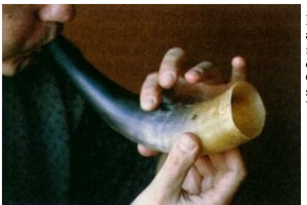
Cow's horn / Goat's horn

Replica of a hom from Västerby in Sweden. It is made from horn of cattle and has four finger holes. Similar instruments have been in use until recently in Scandinavia. The original horn is now in Dalarnas museum, Falun, Sweden