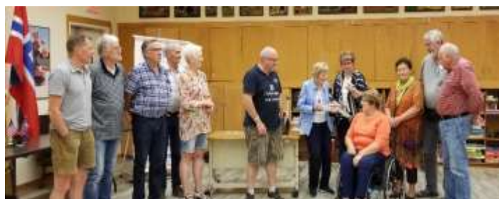
Mange takk to those who provided lodging for our guests.