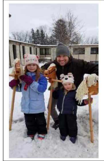
Scandihoovian Fest 2020 It was a “horsey” kind of fun!